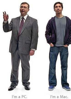
I'm a PC. I'm a Mac.

There are other alternatives, none of them better unless you need online video game rental too, and most of them are summarized here: http://www.alldvrentals.com/